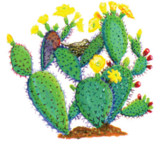
PRICKLY PEAR CACTUS