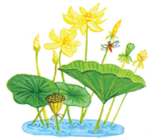
YELLOW AMERICAN LOTUS