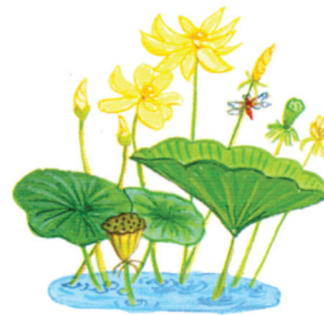
YELLOW AMERICAN LOTUS