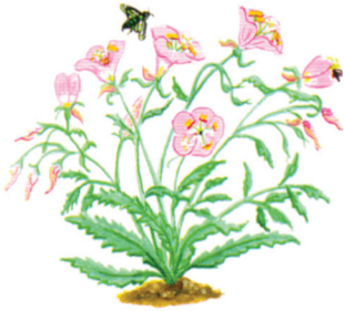
PINK EVENING PRIMROSE