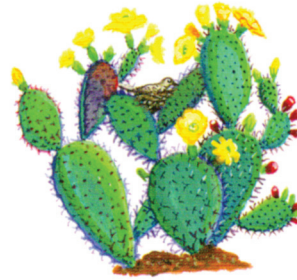
PRICKLY PEAR CACTUS