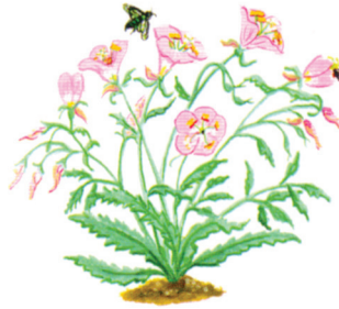
PINK EVENING PRIMROSE